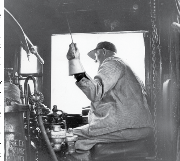
Individual engineers owned the spring-and-chain devices that hooked to the seatbox to smooth their ride.

"4. On Page 7, there is a picture of engineer Mace taken from inside the cab.